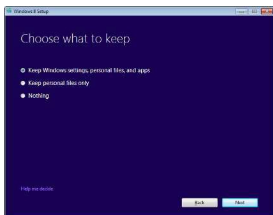
Figure 1: Win 7 » Win 8 / Win 8 » Win 8.1

If you choose "Keep Windows settings, personal files, and apps", Printer Driver will exist. (See figure 1)